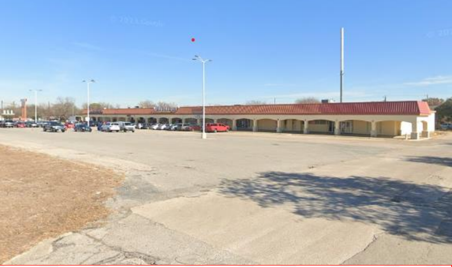
3160 Saturn Rd. Suite #230-C Garland, TX 75041